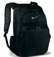
Departure Backpack (Style#TG0126-001)