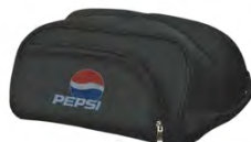
Nylon Shoe Bag (Style# NX-GNSB)