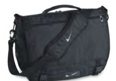
Messenger Bag (Style#TG0159-001)