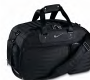
Sm. Departure Duffle (Style#TG0127-001)