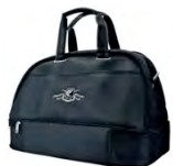
Travel Executive Duffle (Style# NX-GED)