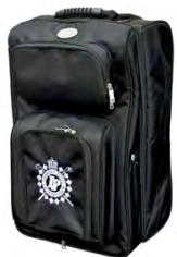
Roller Airline (Style# NX-GRA)