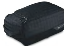
Shoe Tote (Style#TG0130-001)